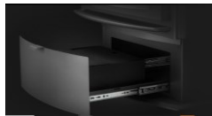
Ash Disposal Kit (Optional)

Clean and contemporary lines with the stately strength of old-world charm, a woodburning stove is a fantastic way to provide heating to your home space. The Timberwolf woodburning stoves are built to be convenient and uncomplicated when it comes to use. The T25 woodburning stove provides an extremely long burn times - up to 16-hours - so keeping toasty overnight isn't a problem at all. And with an output of up to 70,000 BTUs, you'll always be warm. No electricity, no problem. A woodburning stove provides heat and light, no matter what. There's nothing like building a fire, real wood, the smell, the sound, the sight, however, it can also get a little untidy. A built-in, full-width ash lip ensures that your floors remain clean, while the easy-to-remove ash pan ensures that cleanup is a breeze.