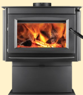
T25 Wood Stove

The T25 woodburning stove is clean and contemporary looking. Featuring EPA 2020 certified woodburning technology and extremely long burn times - up to 16 hours. The extra-large viewing area ensures that you can watch the fire for pleasure instead of babysitting the fire for reloading. A heavy-duty firebox top and full-width ash lip to protect your floor from debris, while a large ash pan with easy glide rollers ensures clean up is effortless. Clean and contemporary lines allow this wood burning stove to blend into your current décor while remaining highly efficient.