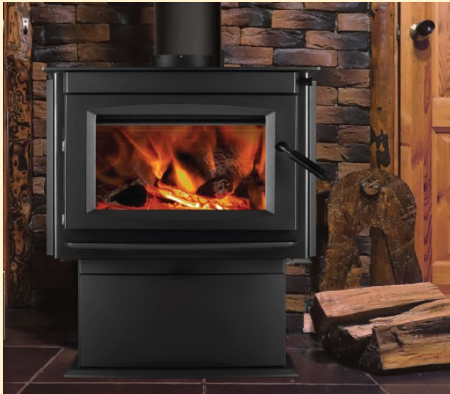
T25 Wood Stove