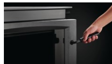
Easy To Open Door Handle