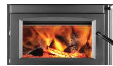
Large Glass Viewing Area