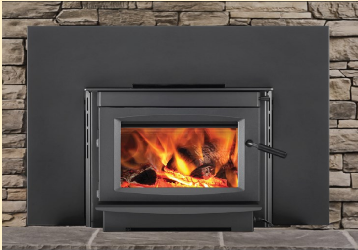
T25I Wood Insert