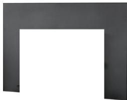
SBP25I3041 - 30"h x 41"w SBP25I3348 - 33"h x 48"w Backer Plate (1-Required)

The Timberwolf T25I woodburning fireplace Insert is clean and contemporary looking. Featuring EPA 2020 certified woodburning technology and extremely long burn times - up to 16 hours. The extra-large viewing area ensures that you can watch the fire for pleasure instead of babysitting the fire for reloading. An included dual blower system quietly circulates heat throughout your room. Clean and contemporary lines allow this woodburning fireplace insert to blend into your current décor while remaining highly efficient.