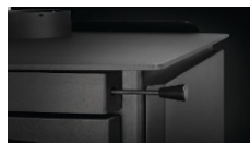
Air Shutter Control