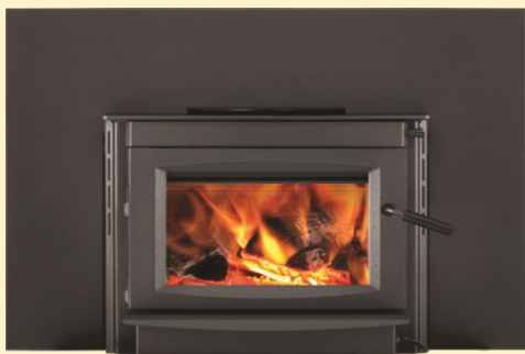
T20I Wood Insert

Self-contained and more efficient than an existing woodburning fireplace opening, a woodburning insert is a great way to ensure that your home is running more productively. Venting out the existing chimney, woodburning Inserts ensure that drafts can no longer enter your home. These inserts are built to exceed standards for clean-burning which ensures loads of even heat and comfort for hours on end. Whether you go with a contemporary, clean-lined look or something a little more on the traditional side, there is nothing compared to the joy and scent of building your own woodburning fire in a woodburning insert.