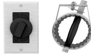
AC01347 Fresh Air Kit with Airtight Damper