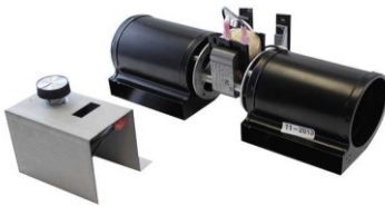
VA4400 Blower with Variable Speed Control